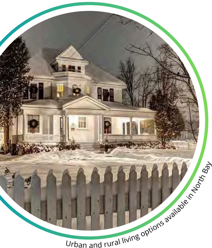
Urban and rural living options available in North Bay

North Bay is made up of seven neighbours: Thibeault Terrace, Airport Hill, Graniteville, Pinewood, Birchaven, Central and Ferris. Each area offers unique attributes and a variety of residential, commercial and natural amenities.