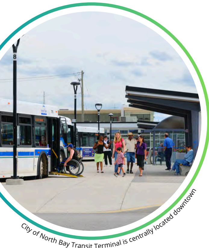
City of North Bay Transit Terminal is centrally located downtown

North Bay is serviced by public transportation, providing an efficient way to travel within city limits. Public transportation is fully accessible to all individuals. North Bay Transit operates 7 days a week, with 9 different routes that service all areas of the city. There is also a system called Dynamic Dispatching that operates weekdays during evenings and on Saturdays. This system allows riders to book their trips using an app, which is available for download at the Apple or Google Play store.