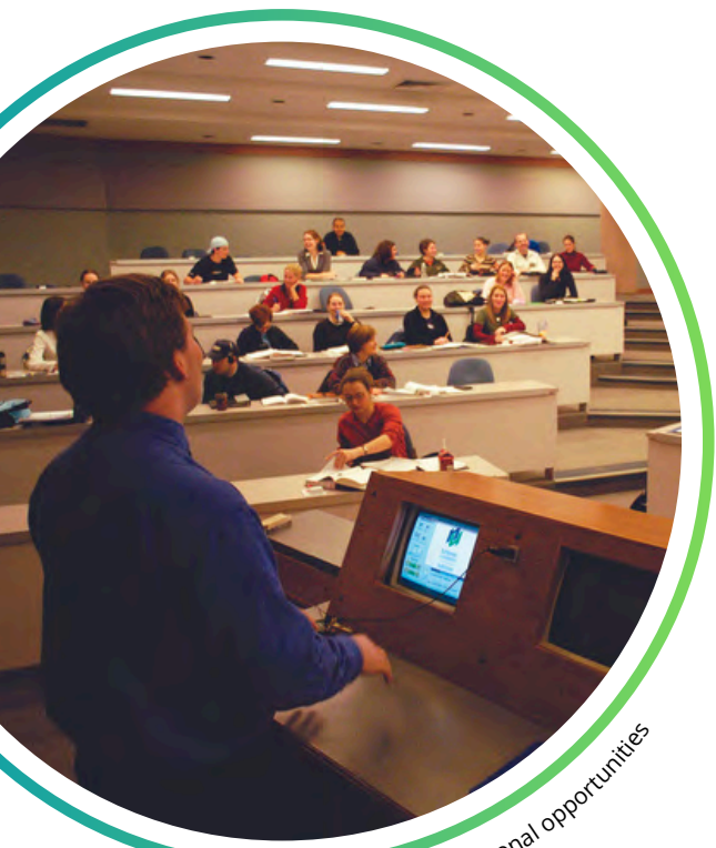
North Bay offers a variety of educational opportunities