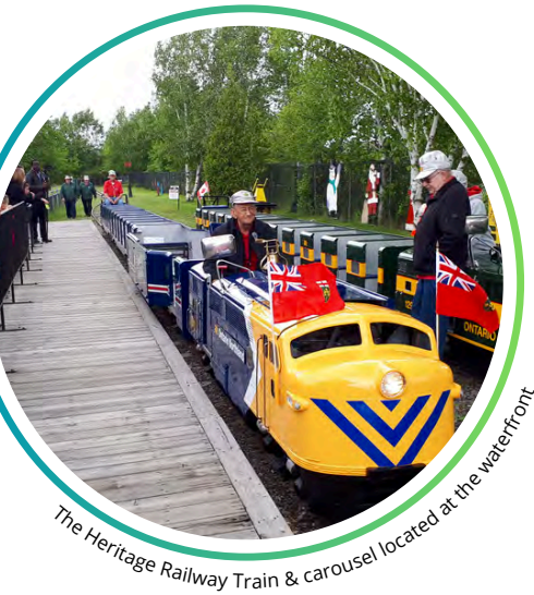
The Heritage Railway Train & carousel located at the waterfront

A variety of recreational opportunities exist in the community provided by the natural environment; trails for walking, biking, or hiking, as well as programs and services offered by the municipality and other community service providers. Visit Tourism North Bay's event calendar for up-to-date information on events happening in the community.