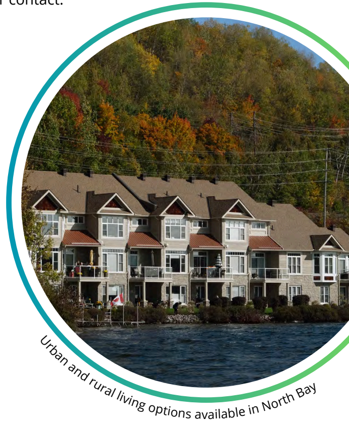
Urban and rural living options available in North Bay