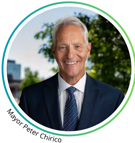
Mayor Peter Chirico

North Bay is a beautiful, safe and diverse community. Nestled between two of Northeastern Ontario's most beautiful lakes. The City values the unique features and people that make our community vibrant and welcoming.