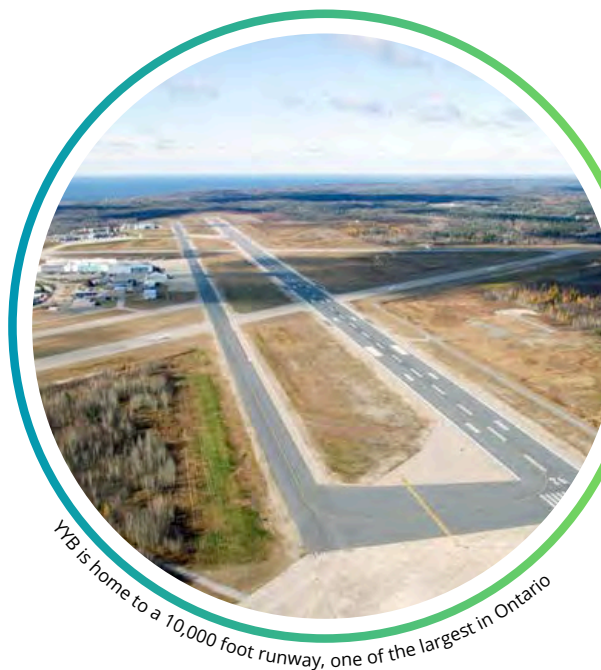
YYB is home to a 10,000 foot runway, one of the largest in Ontario

For more information visit mto.gov.on.ca , call 705.472.7900, or visit a Service Ontario office (locations on page 9).