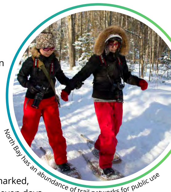
North Bay has an abundance of trail networks for public use

Laurentian Ski Hill is conveniently located in the heart of the community and just minutes from downtown North Bay. Laurentian Ski Hill has a 350 foot vertical drop, with a quad chair lift, magic carpet lift for beginner hill access, and dedicated T-bar lift for the terrain park. Facilities include ski, snowboard, Terrain Park, and ski patrol. Equipment rentals, lessons and snow school camps and programs are available. Visit the website or call 705.494.7463 for more information.