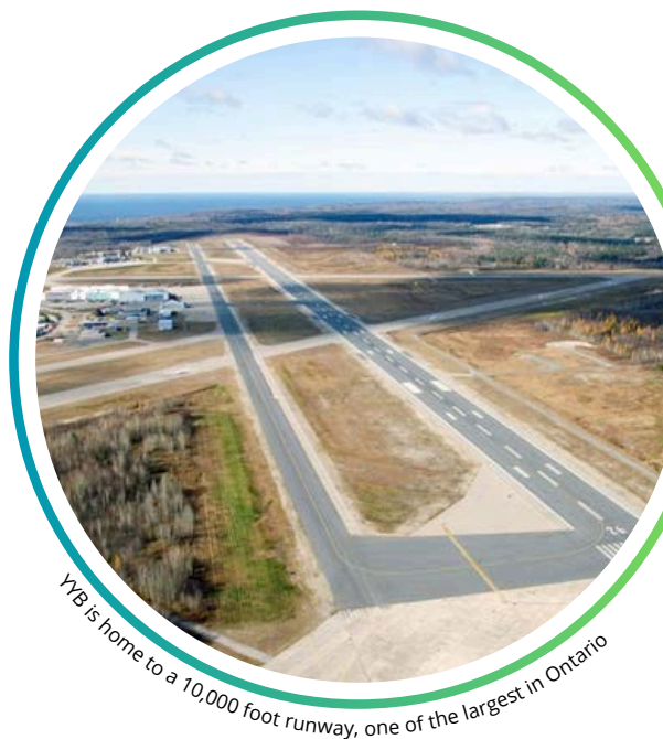
YYB is home to a 10,000 foot runway, one of the largest in Ontario

For more information visit mto.gov.on.ca , call 705.472.7900, or visit a Service Ontario office (locations on page 9).