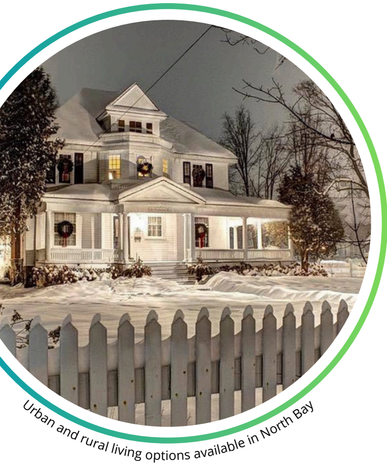
Urban and rural living options available in North Bay

North Bay is made up of seven neighbourhoods: