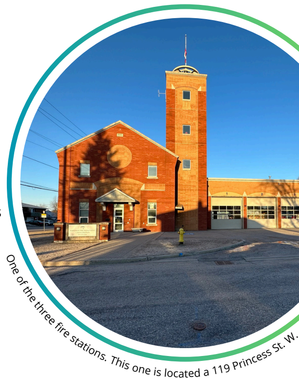
One of the three fire stations. This one is located at 119 Princess St. W.

Please note that burning permits are required for recreational open fires, non-recreational open fires and agricultural fires. These can be purchased at the Customer Service Centre in City Hall located at 200 McIntyre Street East.