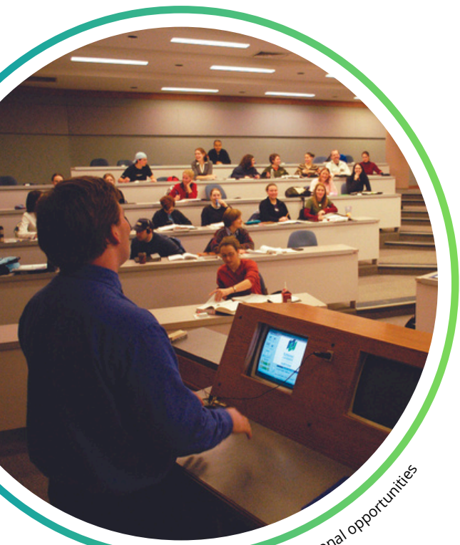
North Bay offers a variety of educational opportunities