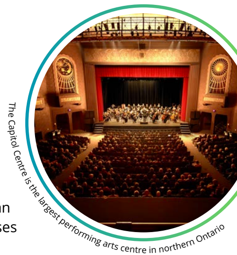
The Capitol Centre is the largest performing arts centre in northern Ontario

To celebrate and share North Bay's rich history, the community has three museums located within city limits. Located in the historic Canadian Pacific Railway station you can find the North Bay Museum that showcases North Bay's past and present. Close to the North Bay Museum, lives the Dionne Quints Museum which is the birthplace of the Dionne Quintuplets. Additionally, the Canadian Forces Museum of Aerospace Defence is a public museum located on the military base.