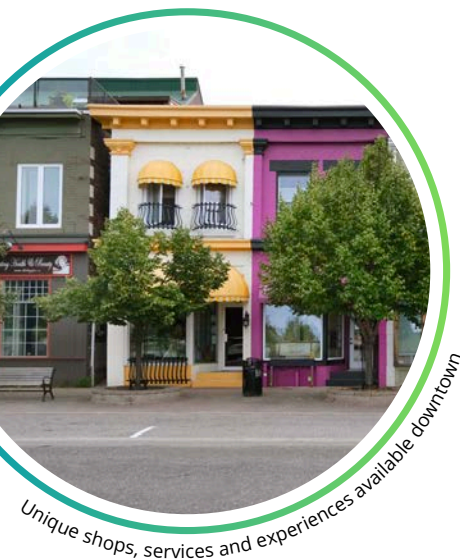
Unique shops, services and experiences available downtown

The downtown core is a vibrant area close to the waterfront and family-friendly outdoor amenities such as the splashpad, parks and walking trails. With numerous retail outlets, professional and personal services, restaurants and hotels, the downtown offers a range of unique products and services. The City of North Bay has a Downtown Waterfront Master Plan to guide development and connectivity between the two core areas. Learn about the plan by visiting the City of North Bay website .