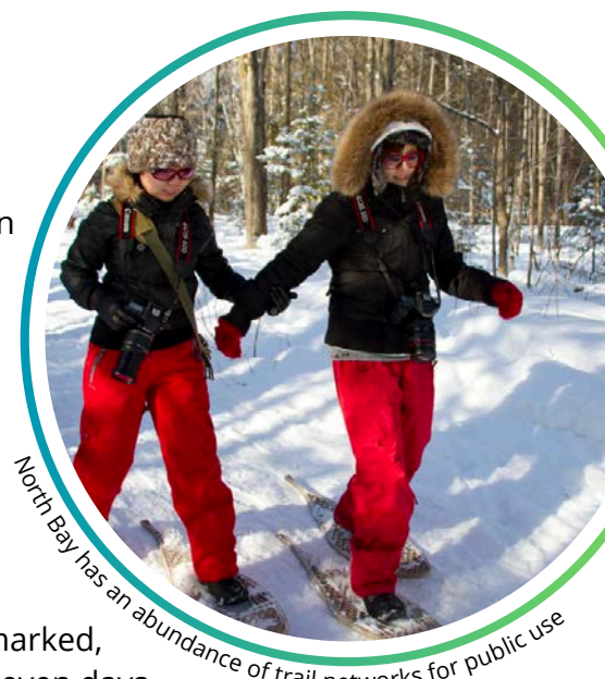
North Bay has an abundance of trail networks for public use

Laurentian Ski Hill is conveniently located in the heart of the community and just minutes from downtown North Bay. Laurentian Ski Hill has a 350 foot vertical drop, with a quad chair lift, magic carpet lift for beginner hill access, and dedicated T-bar lift for the terrain park. Facilities include ski, snowboard, Terrain Park, and ski patrol. Equipment rentals, lessons and snow school camps and programs are available. Visit the website or call 705.494.7463 for more information.