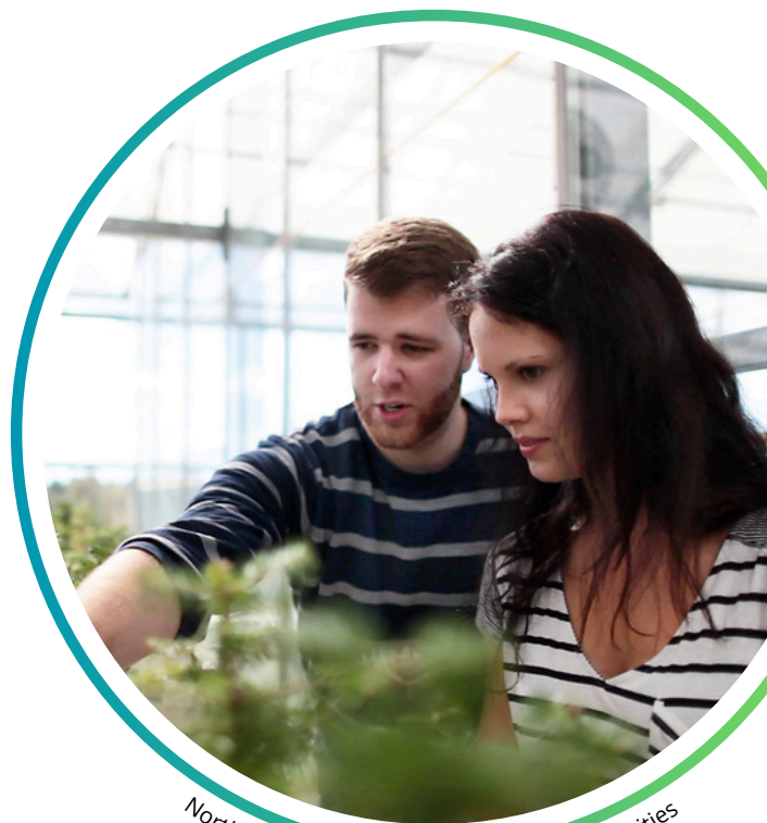
North Bay has a number of training opportunities