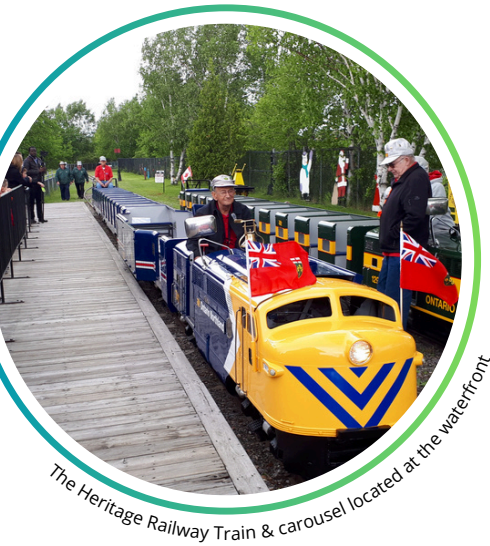
The Heritage Railway Train & carousel located at the waterfront

A variety of recreational opportunities exist in the community provided by the natural environment; trails for walking, biking, or hiking, as well as programs and services offered by the municipality and other community service providers. Visit Tourism North Bay's event calendar for up-to-date information on events happening in the community.